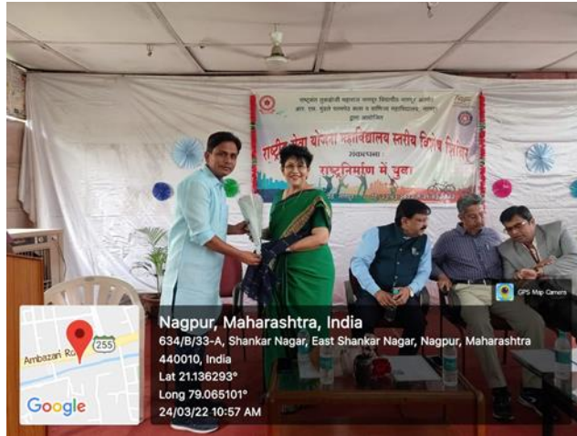
Opening ceremony of Special camp held at Hivare village.